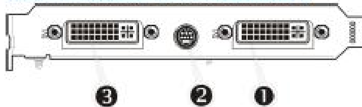
Figure 1-3 ATI Radeon HD 3600 series Connections

The following figure illustrates the typical connections on the ATI Radeon HD 3600 series graphics card. Available connections may vary between models.